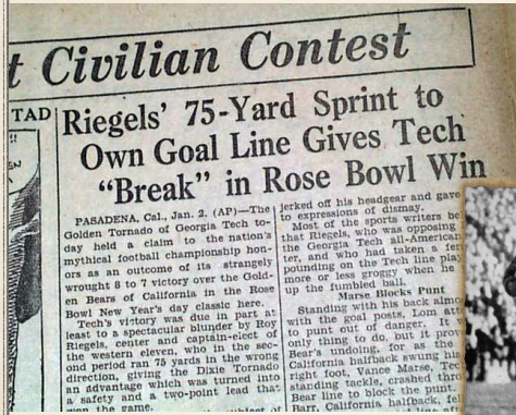
Roy (wrong way) Riegels 1929 Rose Bowl