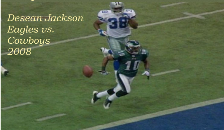
Desean Jackson Eagles vs. Cowboys 2008